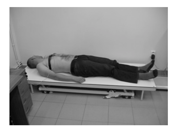
Figure 2. A participant on a table bed with a force platform (Studnička, 2013)