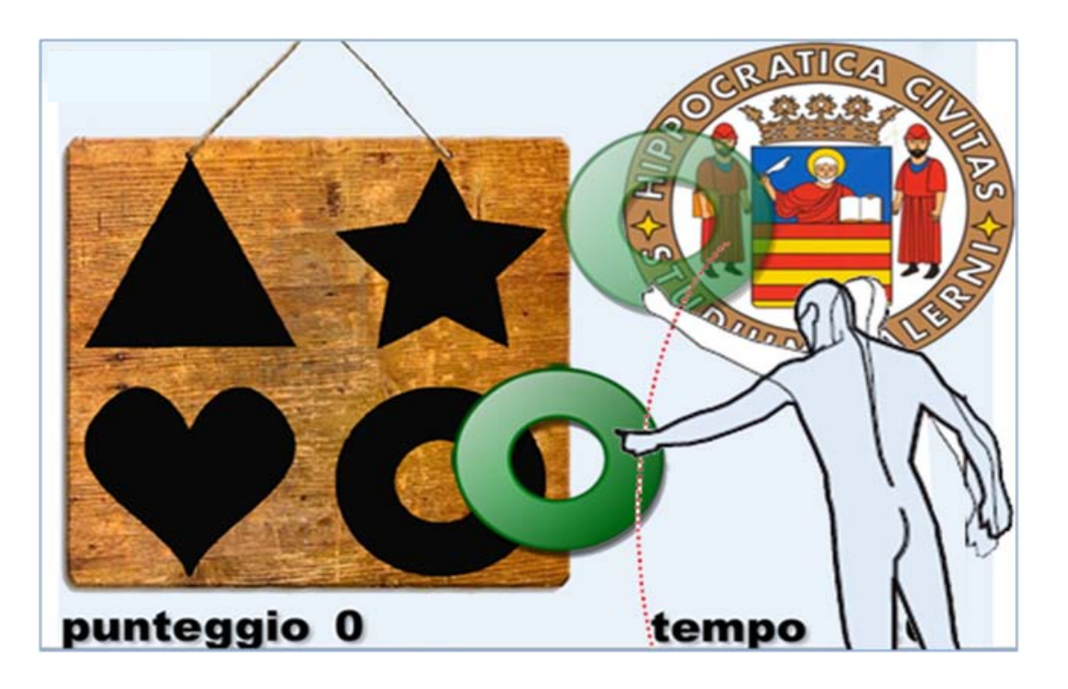
Figure 3. Shape-game.

Once identified the cognitive function to act upon and the data acquisition device to use, we proceeded to the realization of the fourth phase of the methodology described above that is to design and to carry out the first in a series of modules to be implemented within a virtual learning environment. The module achieved is a shape-game where the subject has to recognize shapes, rotate them and place them in special areas of the screen, as shown in the Figure 3.