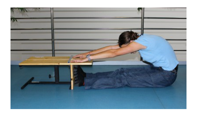
Figure 1. The sit-and-reach test with an overlap over the zero point.

Authors K. F. Wells and E.K. Dillon were among the first researchers, who developed tests of flexibility. They described their "sit-and-reach test" in their publication The sit and reach. A test of back and leg flexibility (1952) . This test can be used for the measurement of flexibility in the area of the lumbar spine and the back part of the thigh. Up to now, there has been a number of variants of this test of flexibility. The main differences lie in the position of the feet to the measuring device (with either both or only one leg leaning towards the desk) and the location of the zero point on the top of the measuring desk. The most natural way of measuring is with the zero point at the level of the feet. In case the tested person can't reach it, its performance is recorded with a minus sign. However, the use of negative values is inappropriate for the statistical comparison of results. At present, we therefore often encounter a variant of the sit-and-reach test, where the zero point exceeds the feet. The most common versions of the test use either a 15 or 25 cm overlap (Figure 1).