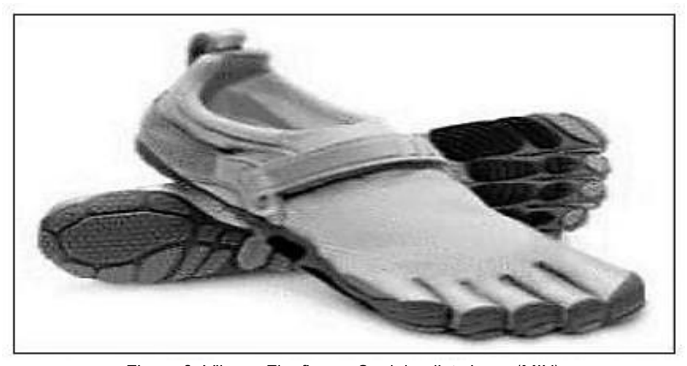
Figure 3. Vibram Fivefingers® minimalist shoes (MIN)