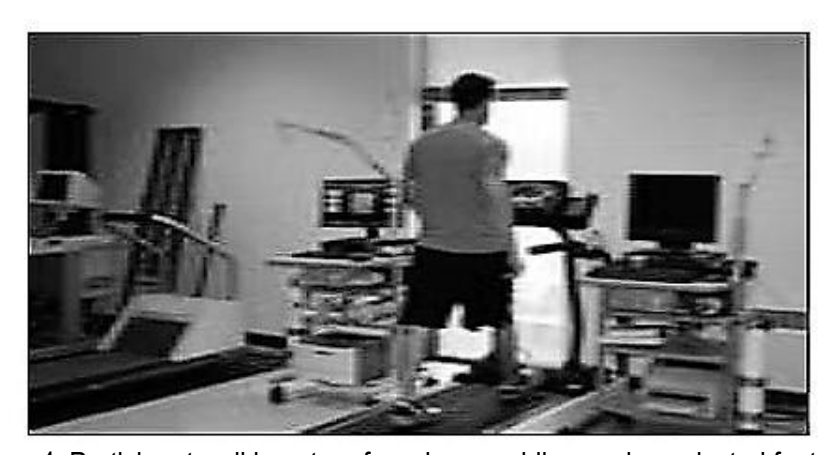
Figure 4. Participant walking at preferred pace while wearing selected footwear