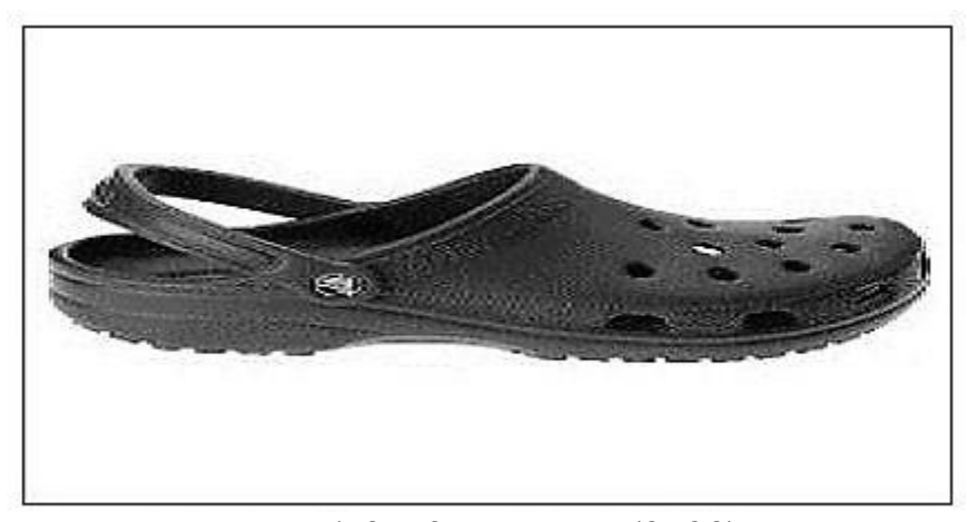
Figure 1. Croc® slip on shoes (CROC)

indoor track. Participants were timed over the middle 50 feet during each trial and preferred pace was determined as the mean pace traveled over those 6 trials in a manner previously described (Browning & Kram, 2005; Chander, Morris, Wilson, Garner, & Wade, 2016; Loftin et al., 2010; Morris et al., 2014; Morris, Garner, Owens, Valliant, & Loftin, 2016). Indirect calorimetry was employed to measure oxygen consumption and related variables during treadmill walking or running using the ParvoMedics TrueOne 2400 (Sandy, Utah) measurement system. Once on the treadmill, participants stood for 5 minutes to assess standing ambulatory rest. Then after a brief warm-up, participants walked a one-mile distance at their preferred pace. Immediately following completion of the one-mile walk, participants stood quietly on the treadmill for an additional period to assess excess post-exercise oxygen consumption (EPOC). This EPOC period lasted for five minutes which for every participant was long enough for the participant to return to resting VO<sub>2</sub> as measured during standing ambulatory rest. The entire procedure was repeated for the three footwear conditions presented in a randomized order. The participants were given at least 48 hours of rest in between their testing sessions.