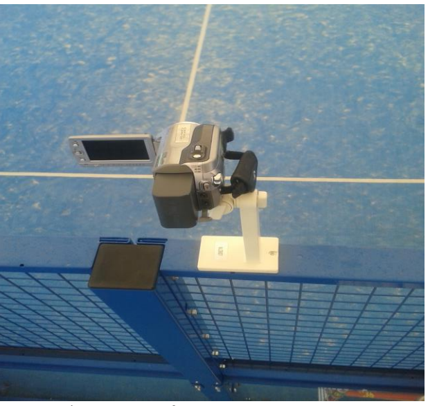
Figure 1. Location of the camera in the padel court

The matches were filmed using two digital video cameras JVC® GZ-MG recording at 25 Hz, each located at the top of each front wall court (four meters above and right in the middle of the court), and each recording half court (Figure 1). Matches footage was analysed with a two-dimensional DLT corrected (Abdel-Aziz & Karara, 1971) video system that allowed calculating the players 2D real coordinates (in meters) from the 2D screen coordinates (in pixels). This methodology has been extensively employed for performance analysis in different able-bodied sports such as football (Mallo, Veiga, Lopez de Subijana & Navarro, 2008) or swimming (Veiga, Cala, Frutos & Navarro, 2013).