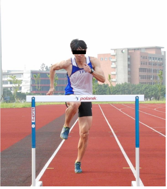
Figure 2. Hurdle Clearance Test Setup