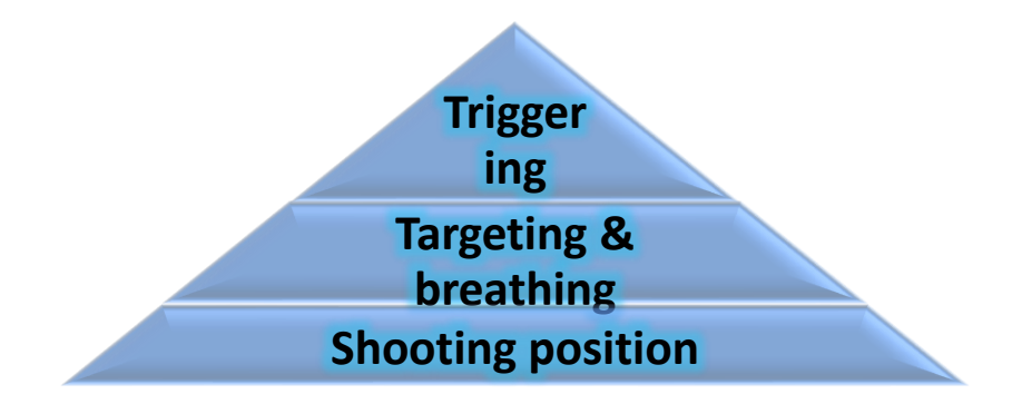
Figure 1. Pyramid of biathlon shooting (Žák et al., 2016).

Žák et al. (2016) put together a so called "Pyramid of biathlon shooting" (Figure 1) and triggering stands on the imaginary peak of it. It means that the athlete who works well with a trigger does not have to be automatically an excellent shooter. It is because all of the components of the shooting technique have to be harmoniously linked to each other. The individual components should be trained separately at first and then, after good acquisition of required skills, they can be joined together. Only key components of endogenous factors were incorporated into the pyramid of biathlon shooting. Exogenous factors influencing final shooting performance were not included into the pyramid.