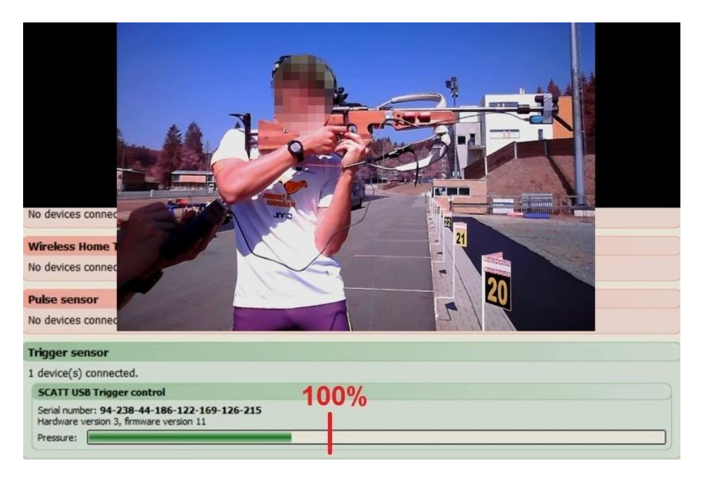
Figure 2. Pressure measuring on the trigger during shooting.

SCATT Trigger Sensor STS was used to obtain the information of the effort which the shooter produces when pressing the trigger (Figure 2). All information was graphically displayed in the researcher's computer. During the test, the participant did not provide any feedback or results about their data.