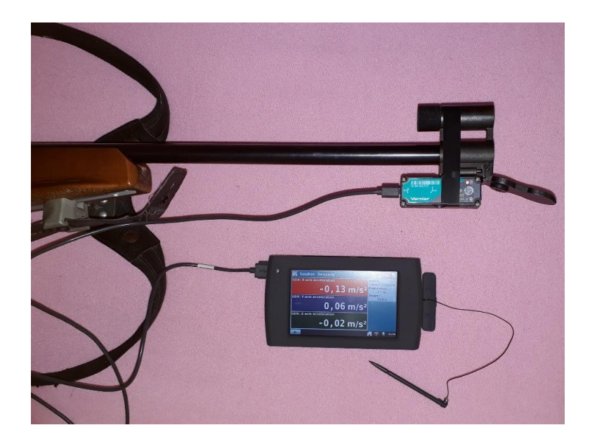
Figure 3. Rifle with accelerometers connected through light weight cable with digital device.