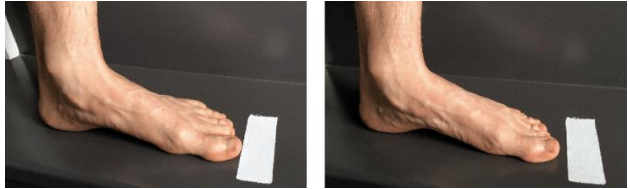
Figure 3 (A and B): The short foot exercise. A: Starting rest position and B: Intrinsic foot muscles activated. Please note the flexion of the first phalange while activating the intrinsic foot muscles and the augmented distance between the tiptoe and the tape due to foot shorten.