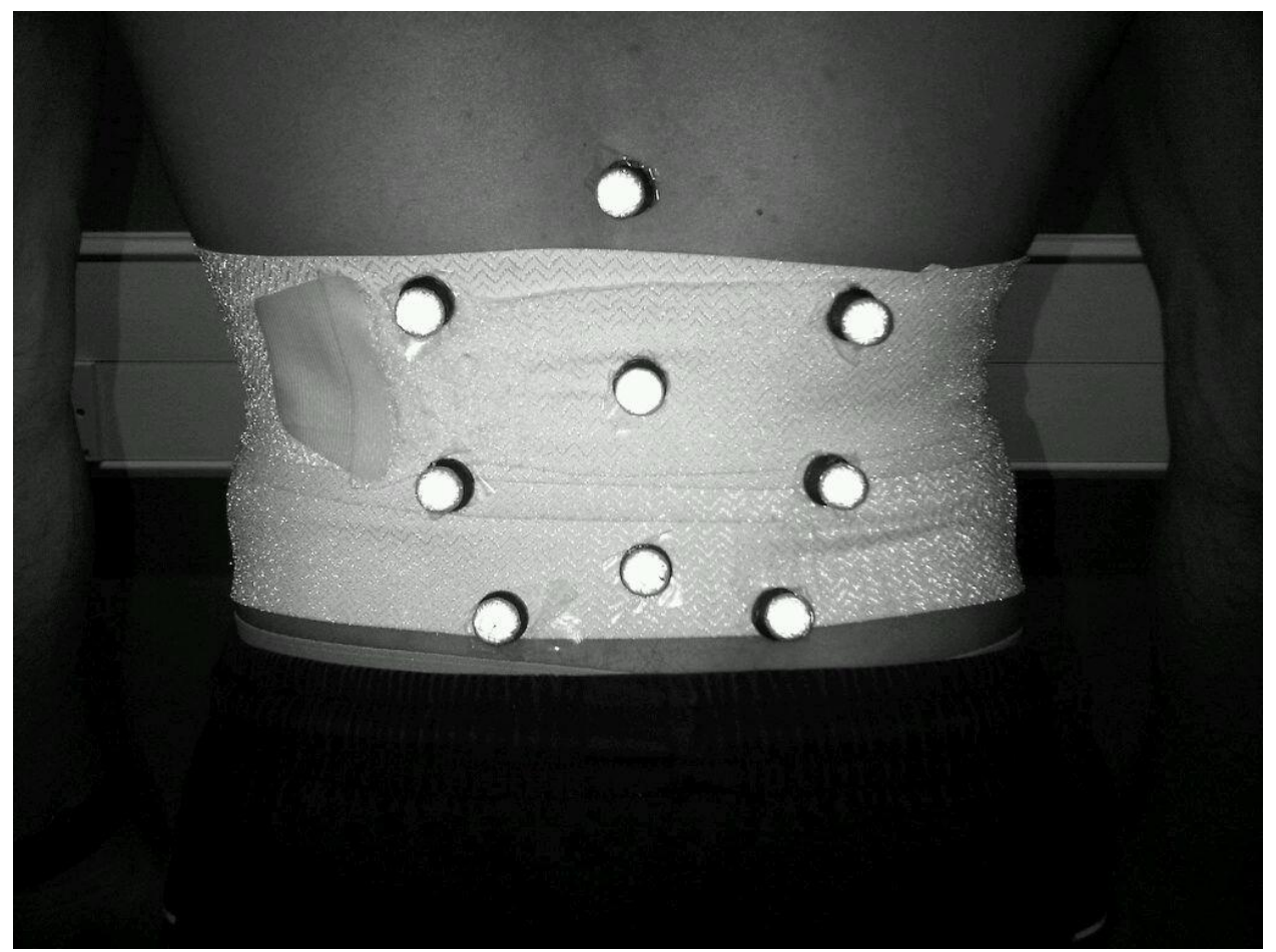
Figure 1a. The full seven markers used to track the motion of the lumbar spine. The reduced marker set consisted of the four markers positioned lateral to the spine.

Two possible configurations of lumbar tracking markers were tested. With the first set (proposed by Seay et al. (2008)) a total of seven markers were used to track this segment. With this approach an elasticon bandage is first wrapped around the lumbar region and three markers placed over the bandage: on the T12-L1 joint space, on the L5S1 joint space and midway between these two markers. Four more markers are then positioned either side of the midline makers (Figure 1a). As explained, this configuration can be difficult to track continuously with a passive capture system and therefore an alternative configuration, consisting of only the four markers positioned away from the spine, was tested. Two possible maker configurations were also compared for tracking the thoracic segment. The first set consisted of a small rigid plate with three non-collinear markers mounted at the top of the sternum (Figure 1b). The second marker configuration also consisted of three makers, two positioned bilaterally on the acromicolavicular (AC) joints and a third over the T12L1 joint space.